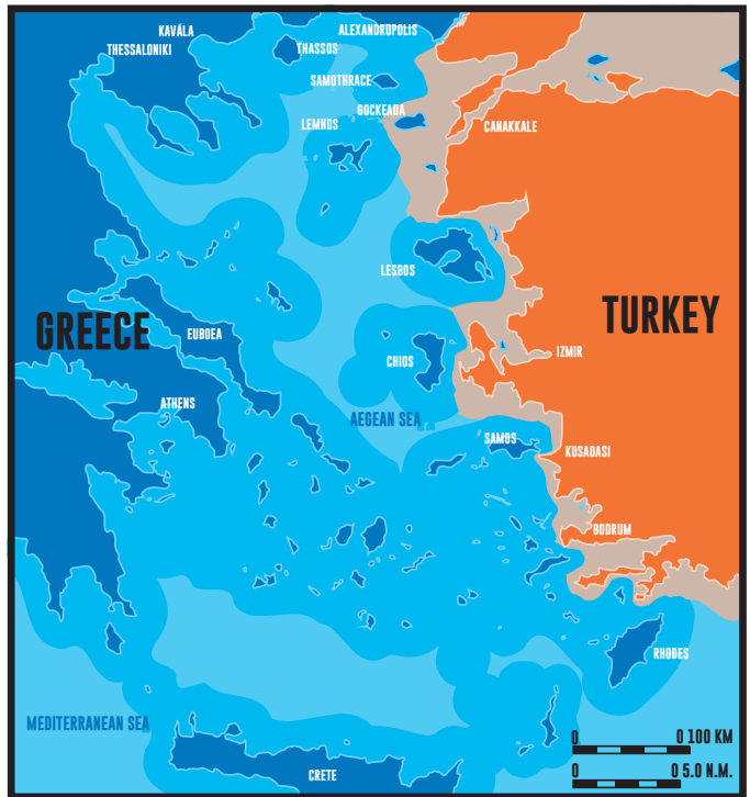
Map of the Aegean Sea, with approximate extent of current 12nm territorial waters.