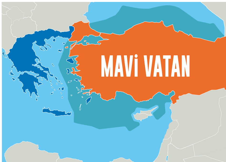
GRAPH 3 TURKEY'S PROJECTED MARITIME BOUNDARIES, ACCORDING TO THE ARCHITECTS OF THE BLUE HOMELAND DOCTRINE

Turkey. 52 In 2019, Turkey began to launch the annual naval exercises “Mavi Vatan” in the Black Sea and the Mediterranean, named in honour of this doctrine as an unequivocal message to Greece and Cyprus. 53