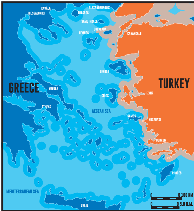
Map of the Aegean Sea, with approximate extent of current 6nm territorial waters.